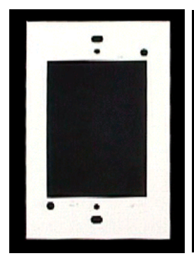
Wiremold Starter Box prior to modifications

The four interior corners of the Starter Box must be cut out so that the Preset 10A will fit. We performed this task using a nibbler tool and a metal file. The process took about half an hour but the finished product is quite acceptable. The drawing shows the portions that must be removed.