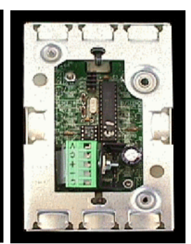
Rear view through Starter Box base