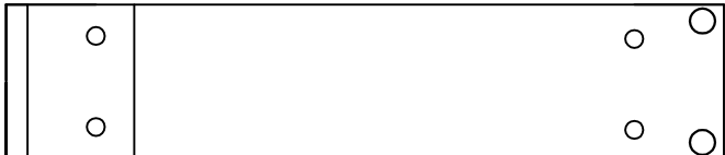
model DMX96ANL SIDE with optional RACK KIT